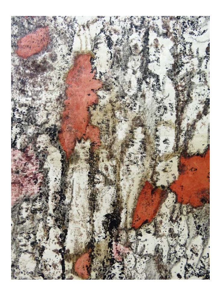
"Small Kingdom", 2014, details, bark print from a Maduca tree in Samriddhy, Auroville