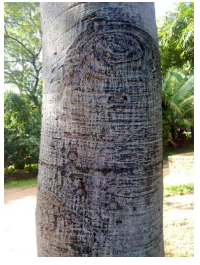
Maduca Tree - Bark after Printing - Cynometra cauliflora Tree