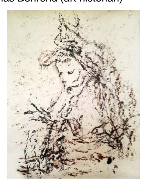
"Tree Spirit", bark print, 100x78 cm